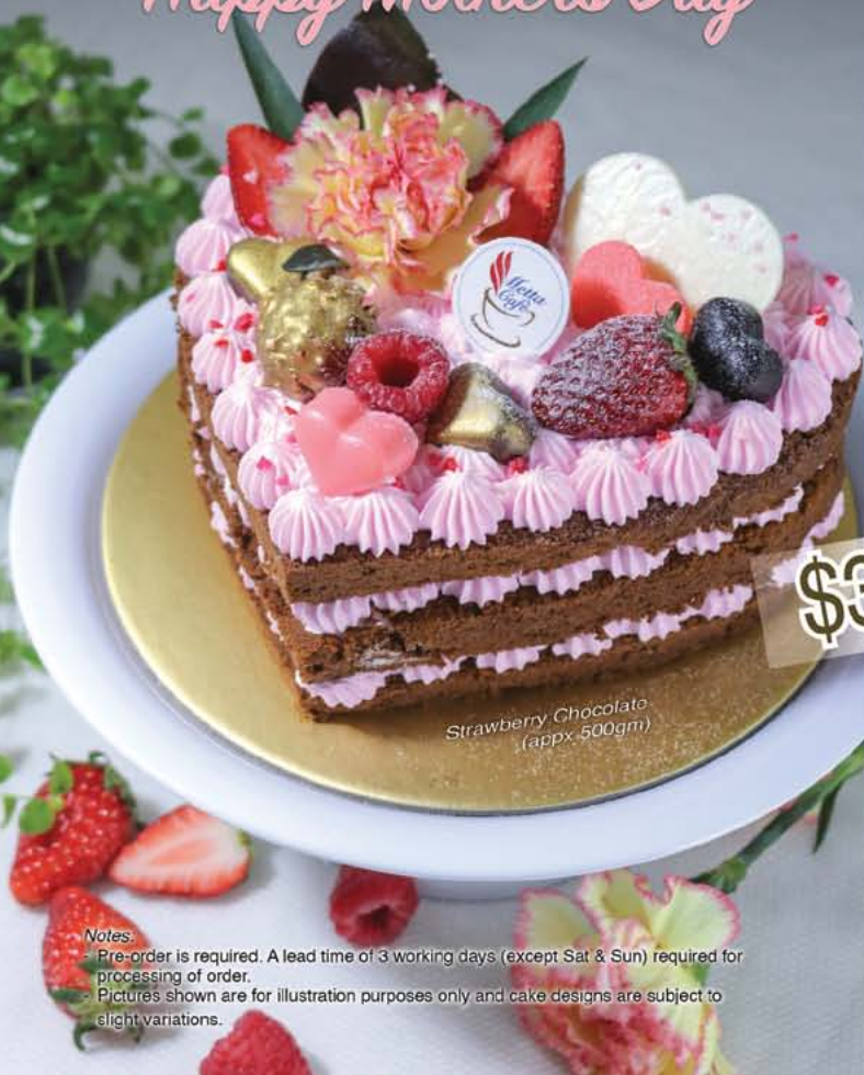
Strawberry Chocolate (appx. 500gm)